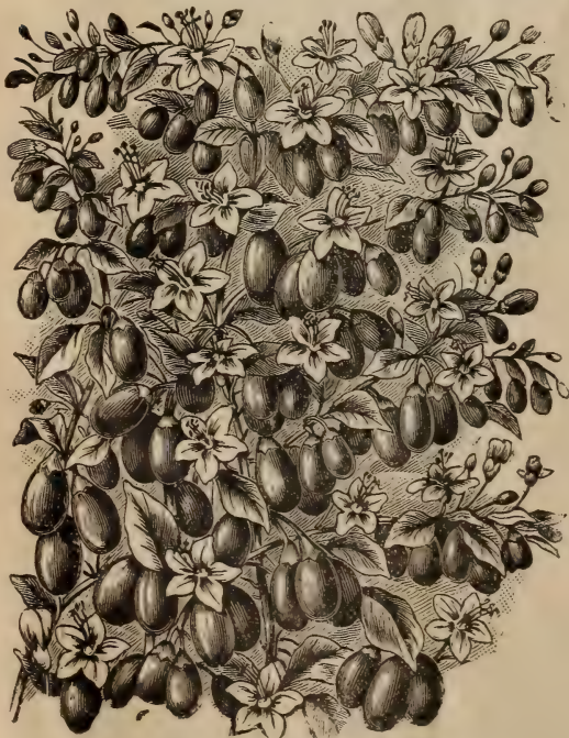
[CHINESE MATRIMONY VINE.]